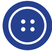
Stamp or Button