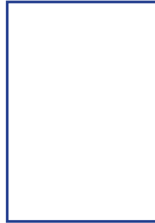
A postcard or piece of paper